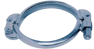
Hinged clamp connection for process connection, type G